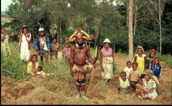
Papua New Guinea (Huli)