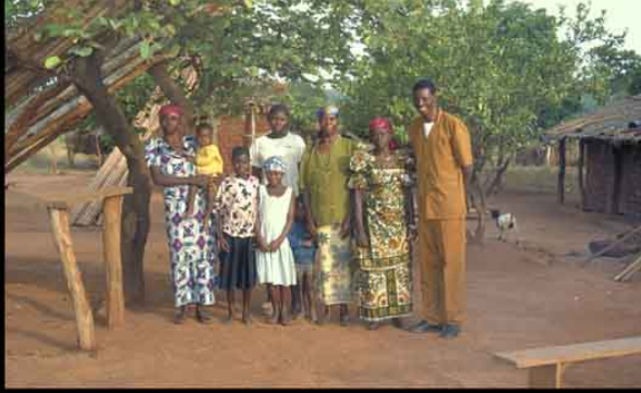
Central African Republic