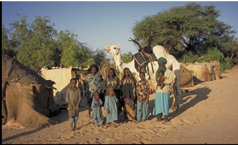
Niger – Touareg