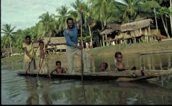
Papua New Guinea (Sepik)