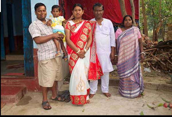
India – West Bengal