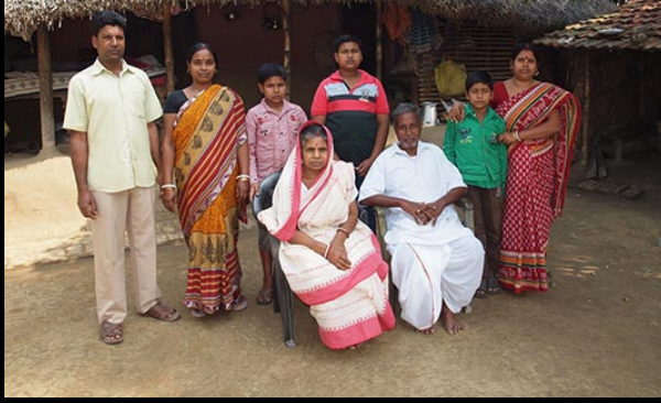
India (West Bengal)