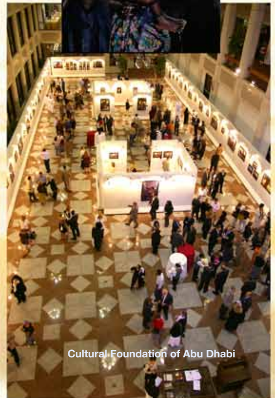
Cultural Foundation of Abu Dhabi