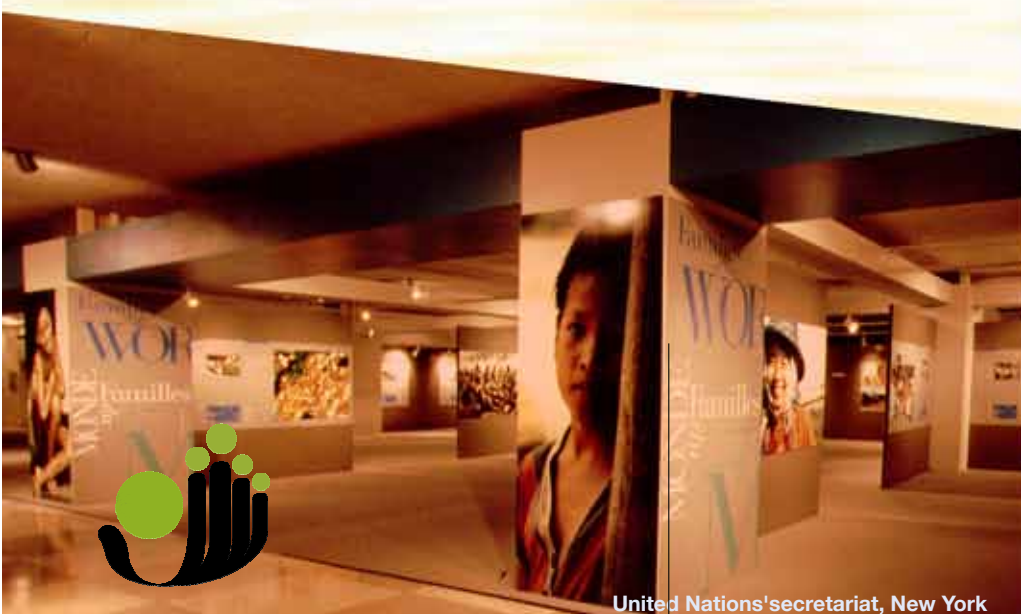
United Nations' secretariat, New York